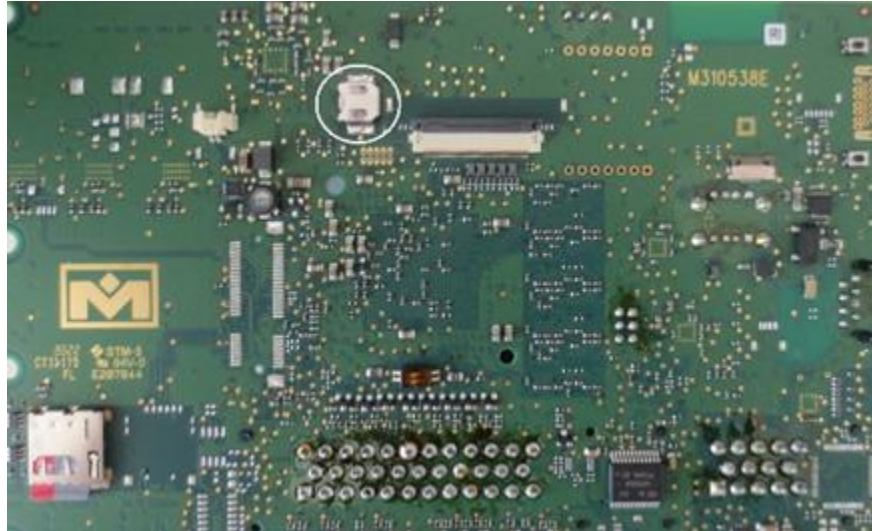
Figure 3: Localisation of the battery (white circle) on the PCB of the MConn 7.

Reassemble in reverse order. Reassemble the control unit in the vehicle. Follow the instructions in chapter 6 Assembly.